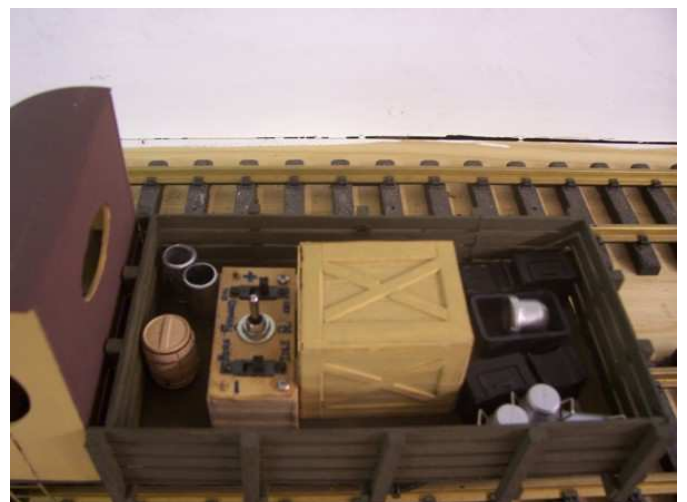
A Tarpaulin may be used to hide the switch box.

Box in centre of rear tray covers motor and gearbox.