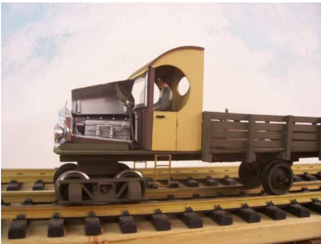
Engine & Hood from a Die-Cast truck model.