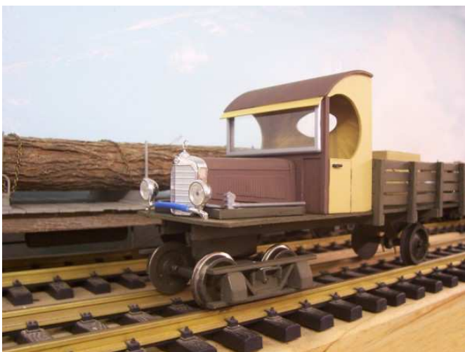
Radiator, engine Hood and Headlights are Diecast parts salvaged from a model car.