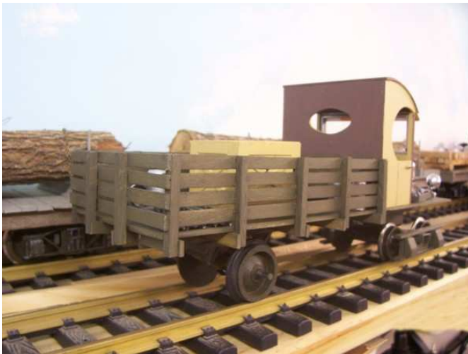
Gearbox fabricated in 0.8mm Brass.