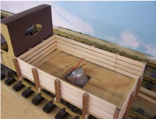
Cab made from 2mm styrene, under-frame and rear tray are 2mm plywood, side gates are split pine.

Freelance model comprising spare parts collected over the years.