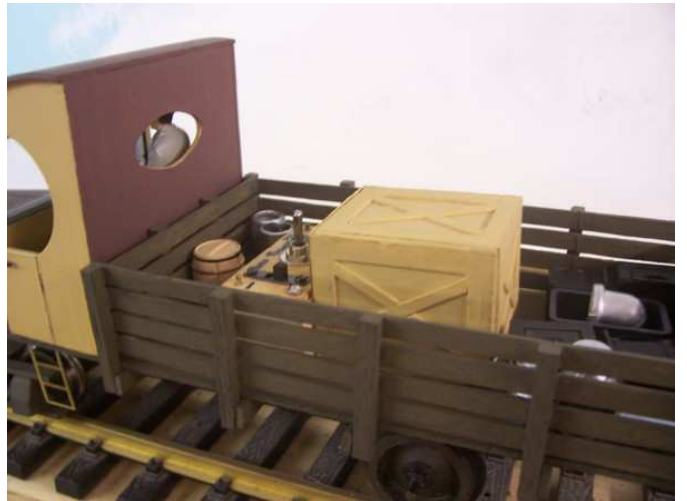
Load in Tray helps take eye away from switch box.