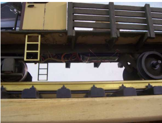
Underfloor is as tidy as can be attained.