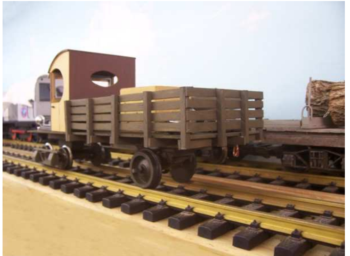
Leading bogie made from Styrene & Brass.